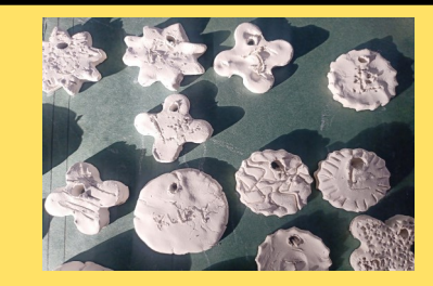
Stamped shapes by Room 11