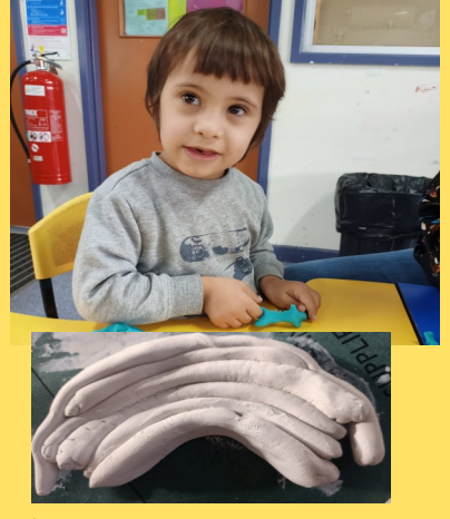
Coiled rainbow by Amr, Room 7